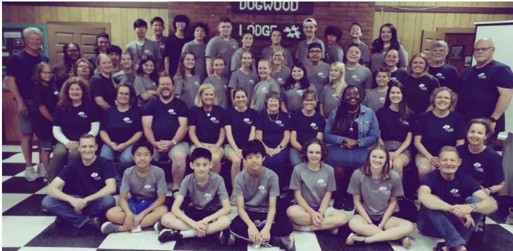
Christian Youth In Action (CYIA) 2022, from the ten CEF chapters across the state of Tennessee