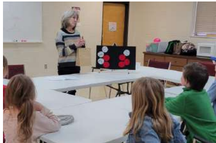
Review game time at Lebanon First Baptist community Good News Club

Save the date! The first annual Good News! Training Conference is scheduled for July 29. Sessions include classes for new Good News Club volunteers, returning volunteers, team leaders, as well as sessions that anyone who works in children's ministry can put to use. More details coming soon!