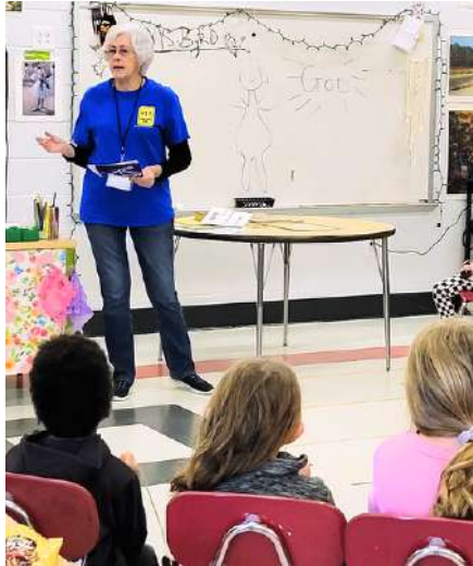
Southside Elementary (Lebanon) Good News Club volunteer introducing lesson